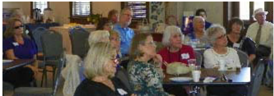
Audience hears description of fashion.

Fashions of the time were restrictive and unhealthy and the move toward functional clothing that allowed the wearer to do something useful corresponded with the push to be allowed to do more useful things. Later, suffragists were found in at least two types of clothing—those who dressed in practical, somewhat masculine fashions so as to be taken seriously and those who put on huge hats and plenty of lace so as not to seem threatening. (continued on page 2)